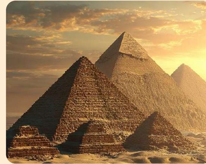
V Wonders of the World