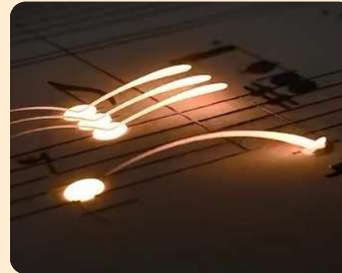
V Notes in Music