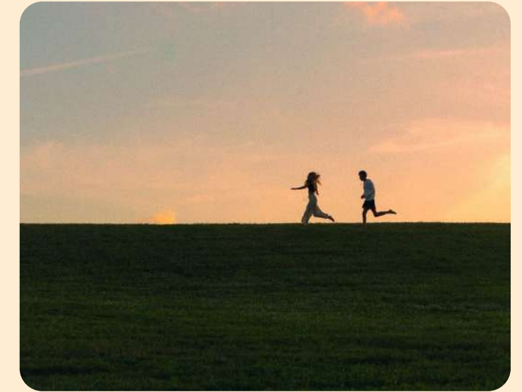
V Days of the Week